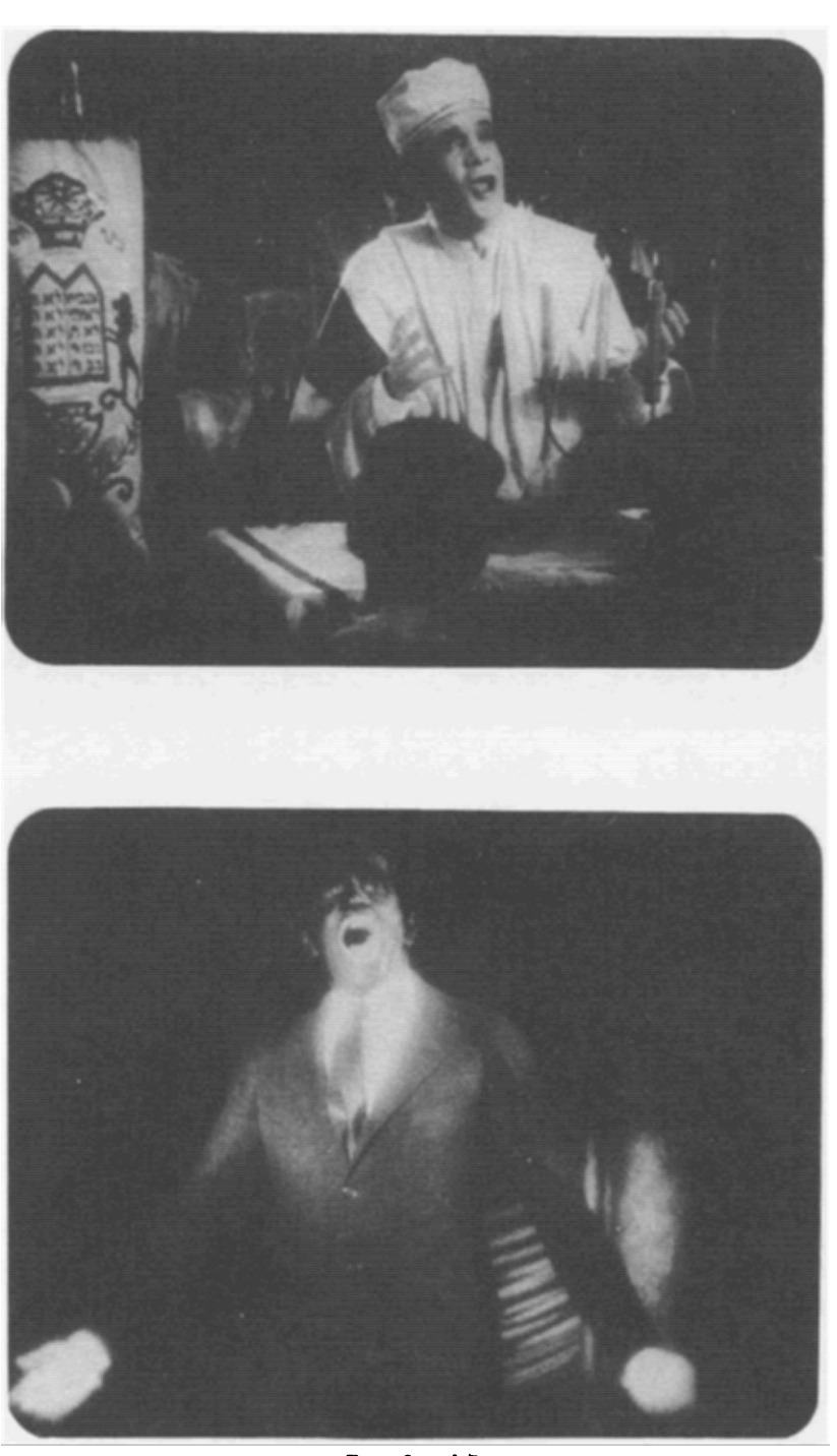
Figs. 6 and 7