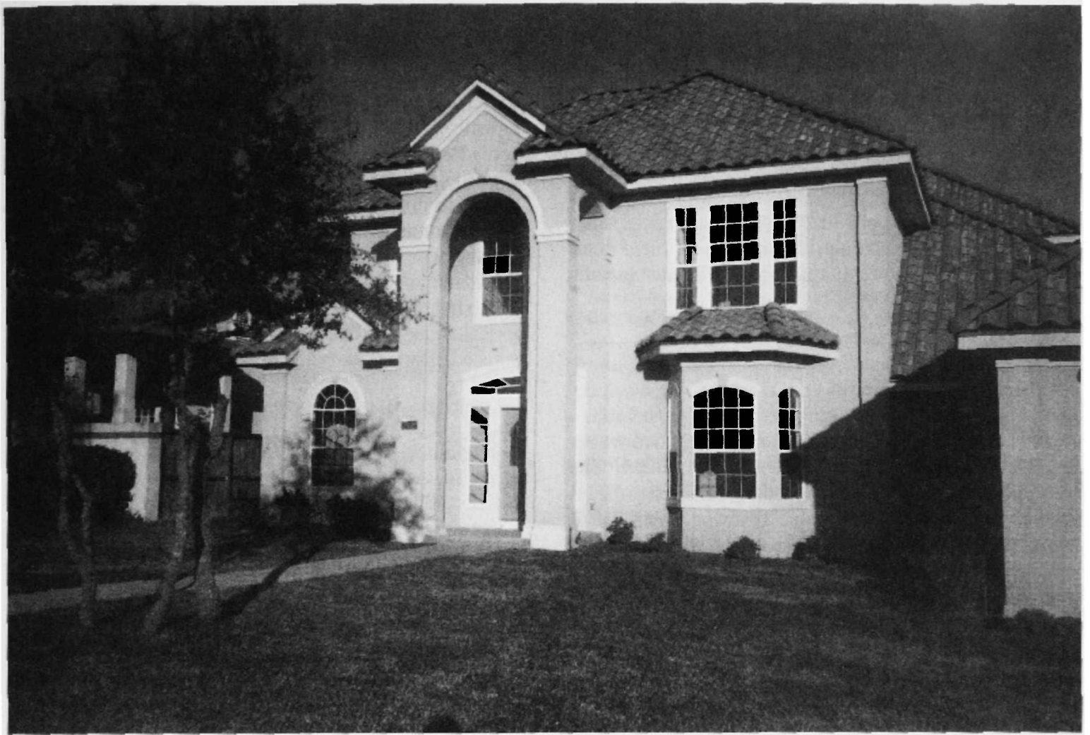
Figure 3. Scottsdale-style house.

communities, interviews with key informants such as the developers and real estate agents, and the collection of marketing, sales, and advertising documents. An unstructured interview guide was developed to elicit residents' decision-making processes concerning their move to the gated community. The research team 7 collected field notes and interviews in the New York area, while I worked alone in San Antonio. The interviews lasted between one to two hours, depending on whether the interviewer was taken on a tour of the house. We did not ask to be taken on a tour, but many times interviewees offered, and we used the tour to learn more about the person's tastes, interests, and preferences.