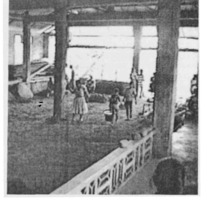
Figure 1. People entering the feast house on their way to ascend the platform.

On the side platforms (visible in Figure 1) sit those referred to as tohn kapar (lit. "members of the entourage") (Shimizu 1987:136). There is a "tendency for the people who sit on the side platforms to arrange themselves by