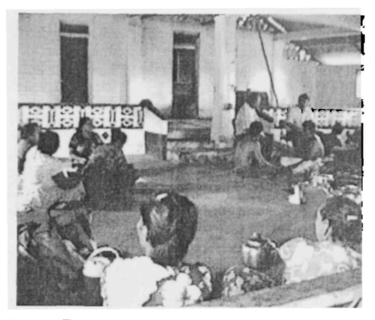
Figure 2. The chiefs are vertically highest on metal chairs (see top right—the secondary chief is on the right and the paramount chief next to him). while the paramount chieftess (see top left) sits on the floor (the current secondary chieftess was not in attendance). In the background are stairs to the level above the chiefs and chieftess, where the ancestor spirits of the chiefs are located during feasts. Sitting directly in front of the chiefs and the chieftess, facing sideways, are their kava servers.

rank, those with higher titles sitting toward the rear" [further inward] (Riesenberg 1968:98).