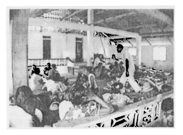
Figure 3. A man ascends the platform to greet the chiefs and chieftess. More participants have arrived and are seated on the platform.

Signs, however, also oppose each other in the creation of hierarchy during feasts. Lower status people find themselves physically higher in space than chiefs, for example, when they ascend the platform where the chiefs and chieftesses sit, in order to greet them. (In Figure 3 a man has just climbed up on the platform to greet the chiefs and chieftess; in Figure 4 the same man bows as he greets the paramount chieftess.)