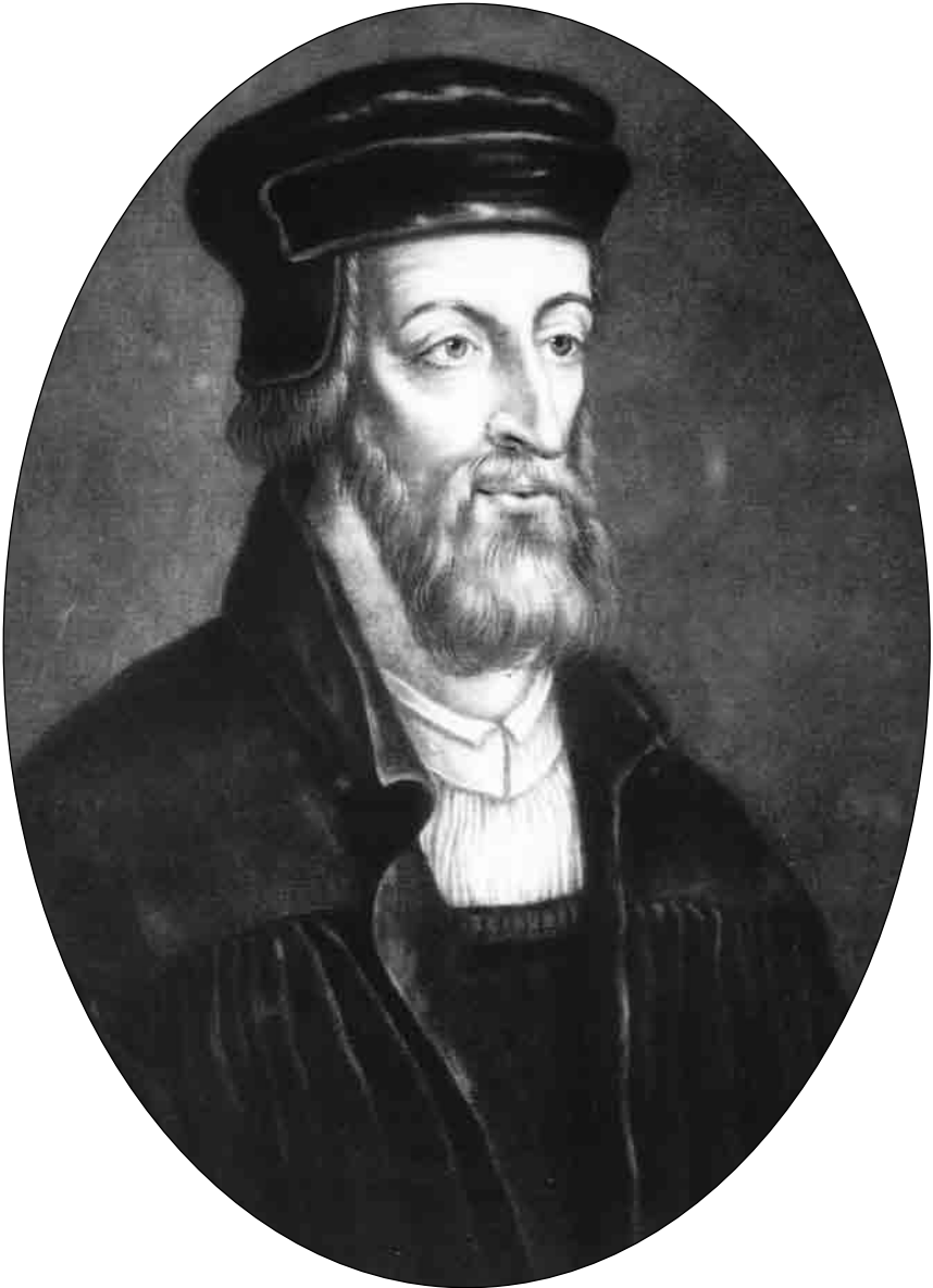
7. The Oxford theologian John Wyclif whose teachings inspired religious revolution in England and on the Continent, and prefigured the teachings of Martin Luther.