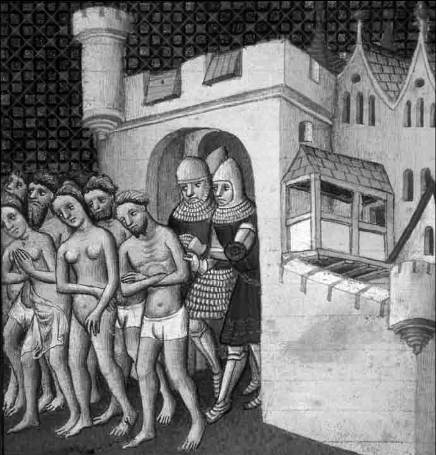
2. Northern French knights, with the support of the pope, force heretics from Carcassone, the great stronghold of Albigensian heretics during the Albigensian Crusade. The crusaders would not only weaken heresy in the south but would also damage southern French culture and help the kings of France extend their authority in the region.