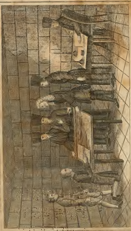
Custos receiving the oath, Pg. 20.