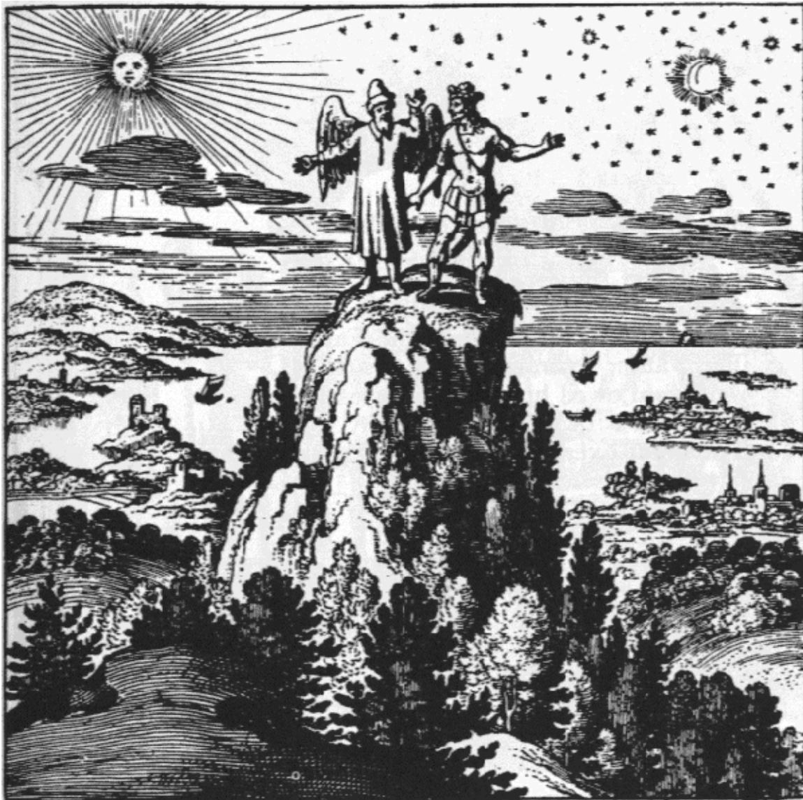
In Emblem 12, we see the guide with his charge high upon the mountain standing on the threshold of the spiritual world, the archetypes of the Sun, Moon and Stars around them.