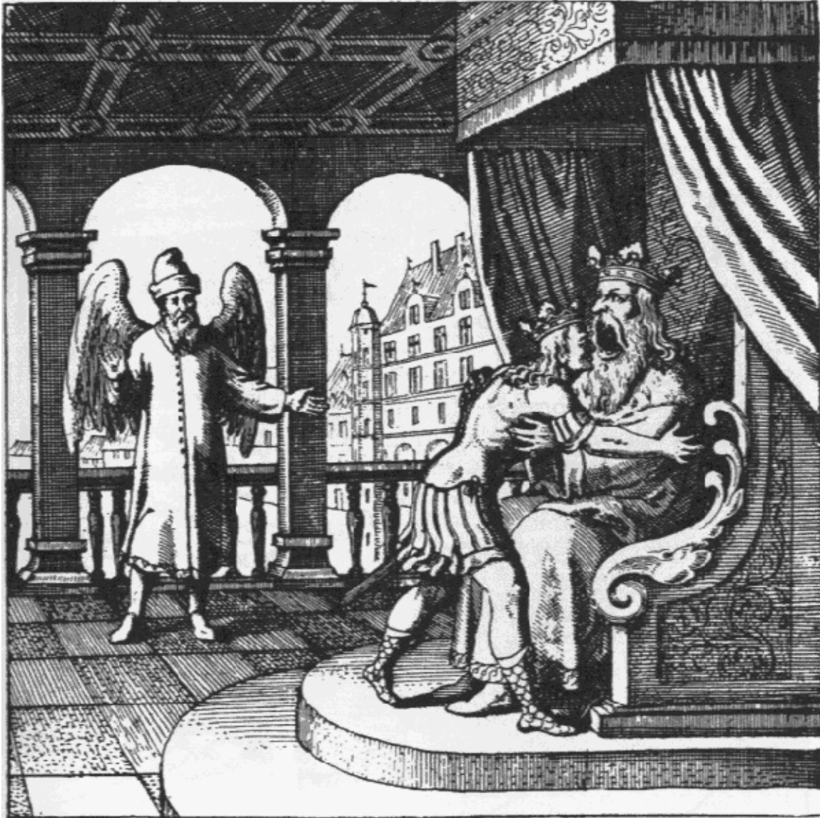
The old King was as dead without his son and when the young Prince returns with his guide, his father is so pleased to see him that he swallows his son. This is pictured in the thirteenth emblem.