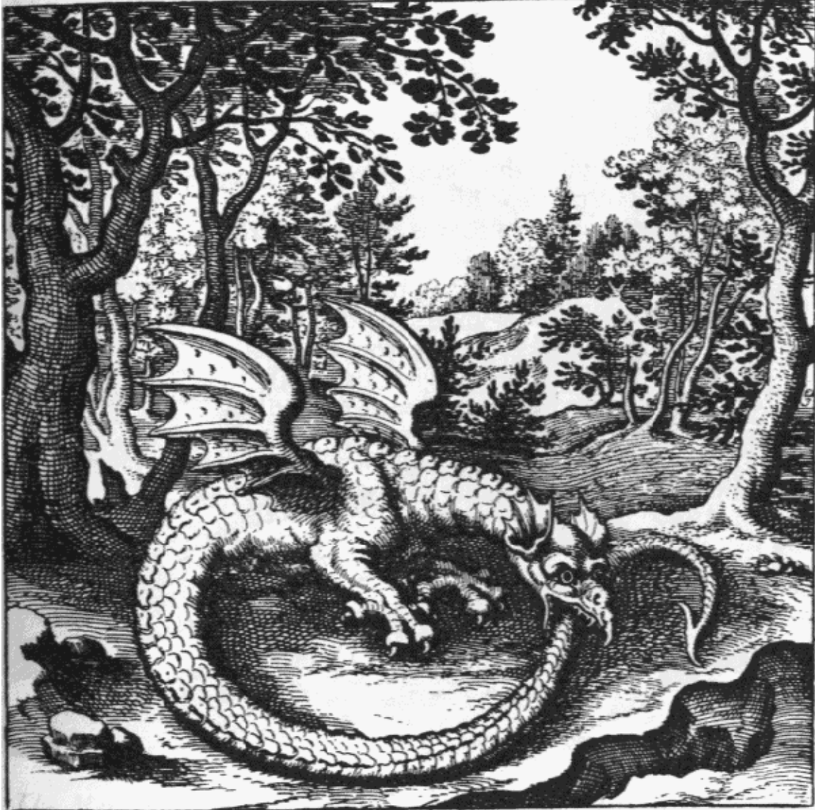
Emblem 6 is a clear statement of the Ouroboros, the serpent dragon that siezes its own tail and unites these polarities in forming its circle in the Soul.