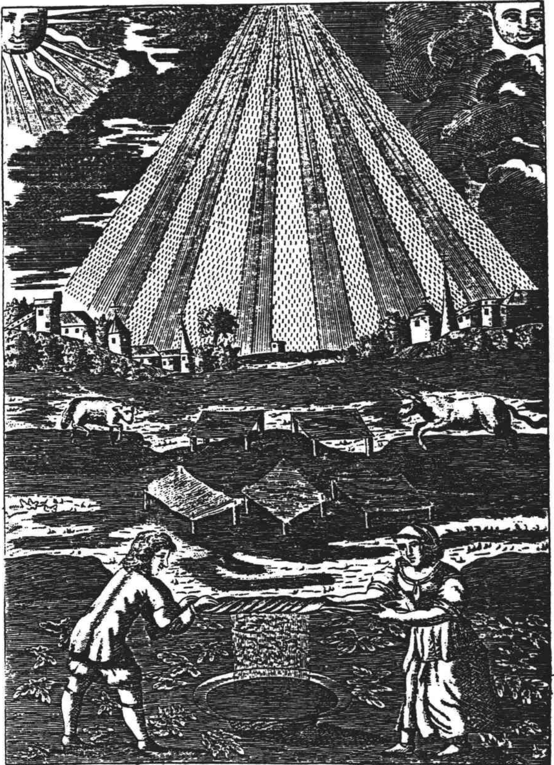
Gathering May Dew