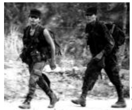
Contras in San Miguel, El Salvador, after a mission to Honduras.