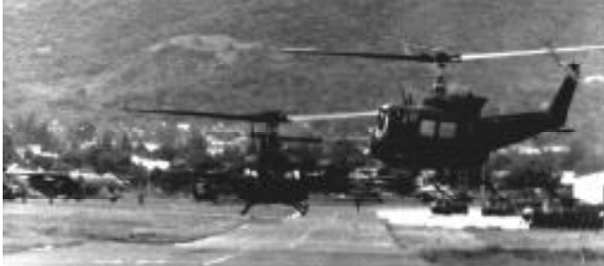
Back from Nicaragua: Contra helicopters landing at Ilopango.

US politicians continue hollering for stronger law enforcement tactics and tougher sentencing guidelines. They vote to give the Colombian military $1.3 billion dollars—so it can turn around and buy 68 Blackhawk helicopters from US arms merchants—to assist Colombia in its War on Some Drugs. The lies have a personal effect on our lives. This is not a harmless little white lie—this is costing thousands of