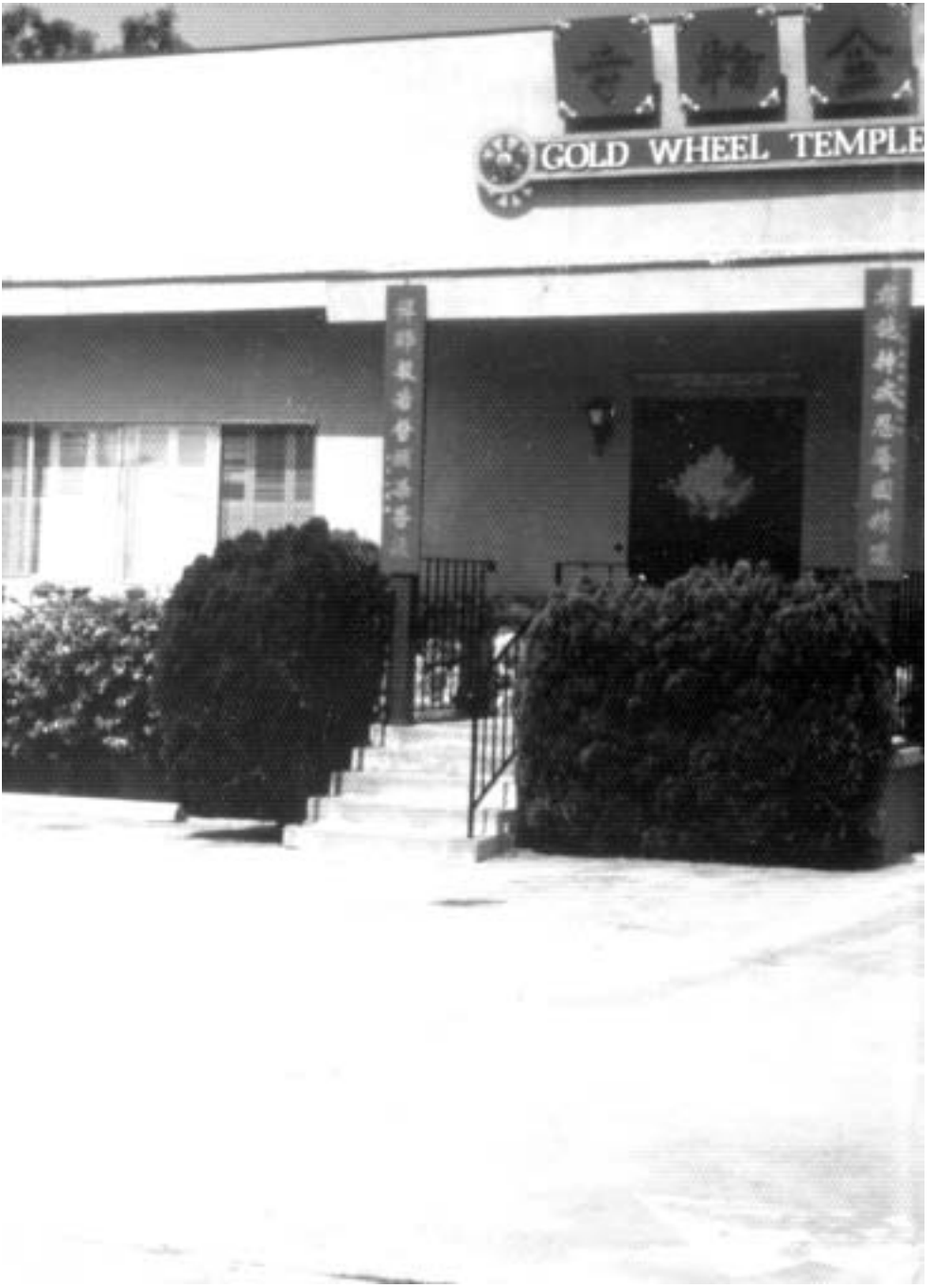
Gold Wheel Monastery, South Pasadena. November 1977