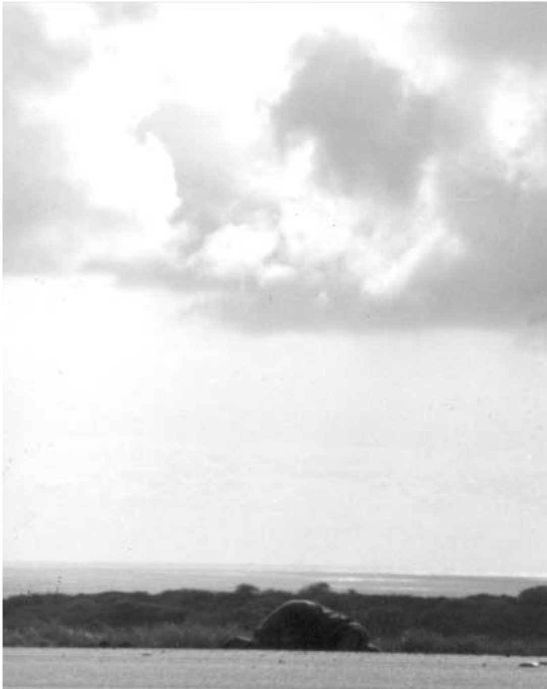
Final bows at sunset, along the Pacific Ocean