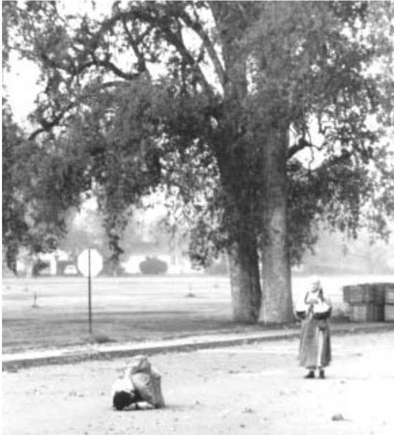
Arrival at the City of Ten Thousand Buddhas on a foggy morning. November, 1979