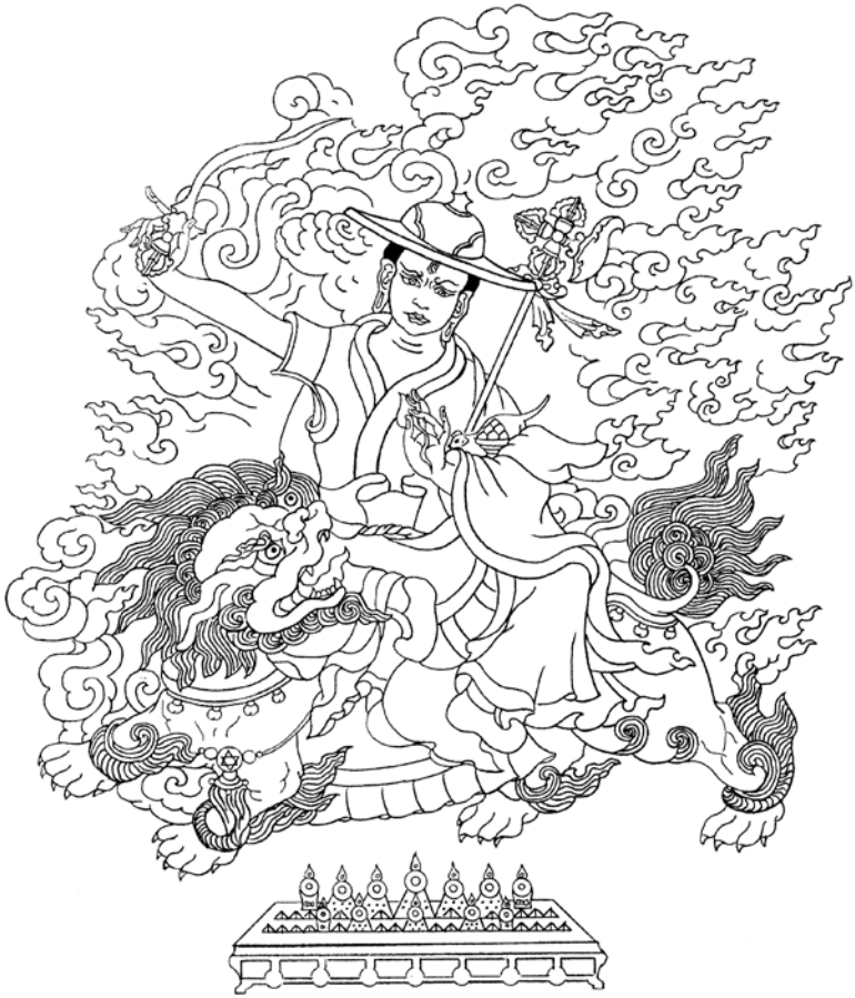
Wisdom Dharma Protector