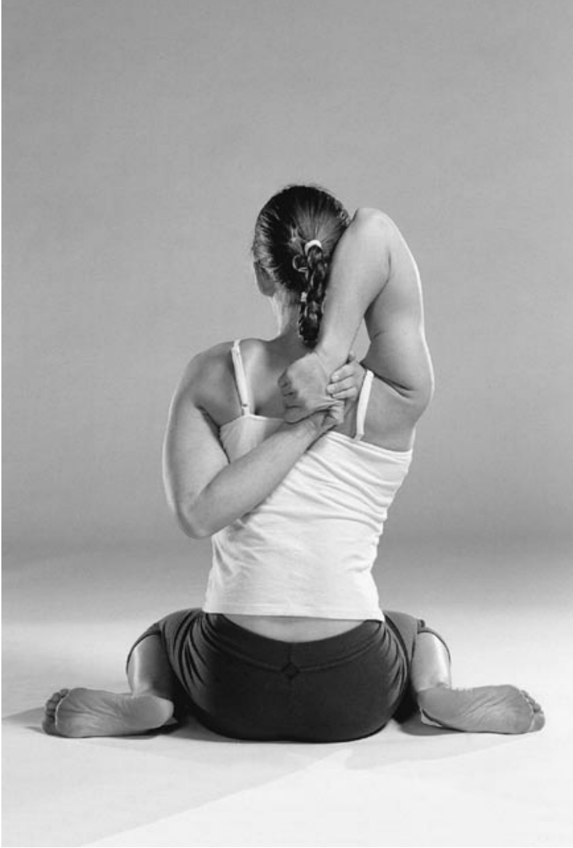
गोमुखसन – Gomukhasana