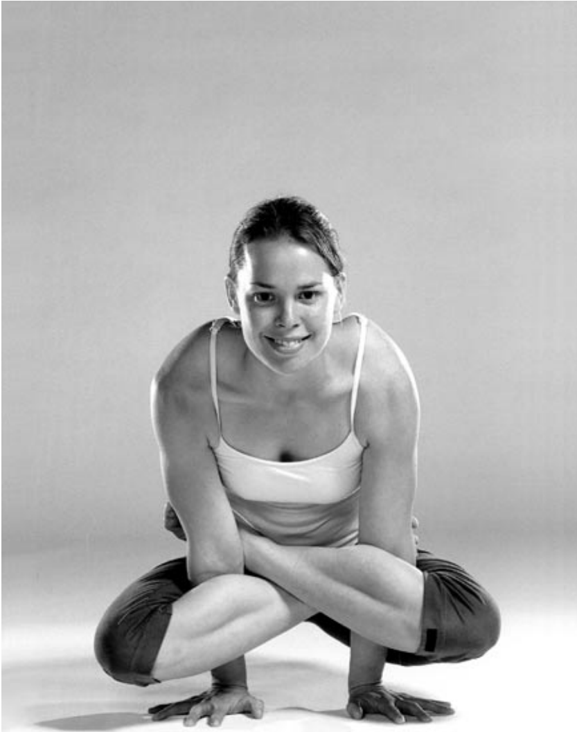
कुक्कुटासन – Kukkutasana