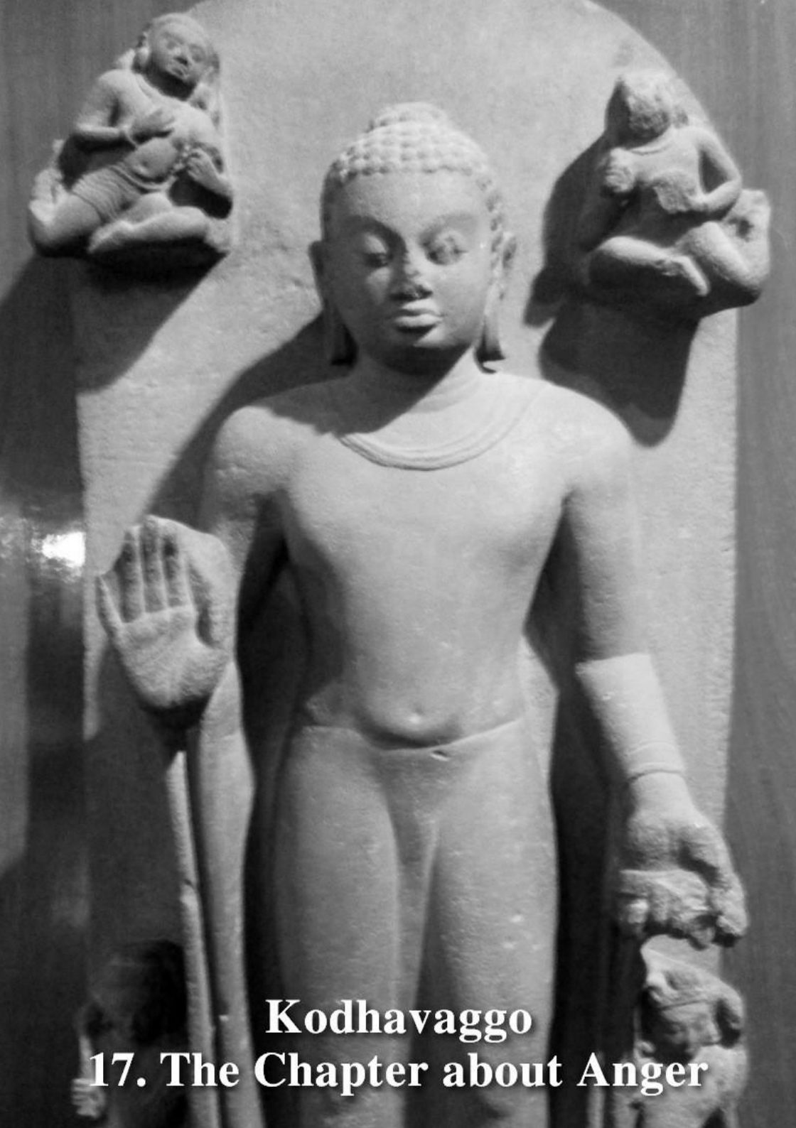
Kodhavaggo 17. The Chapter about Anger