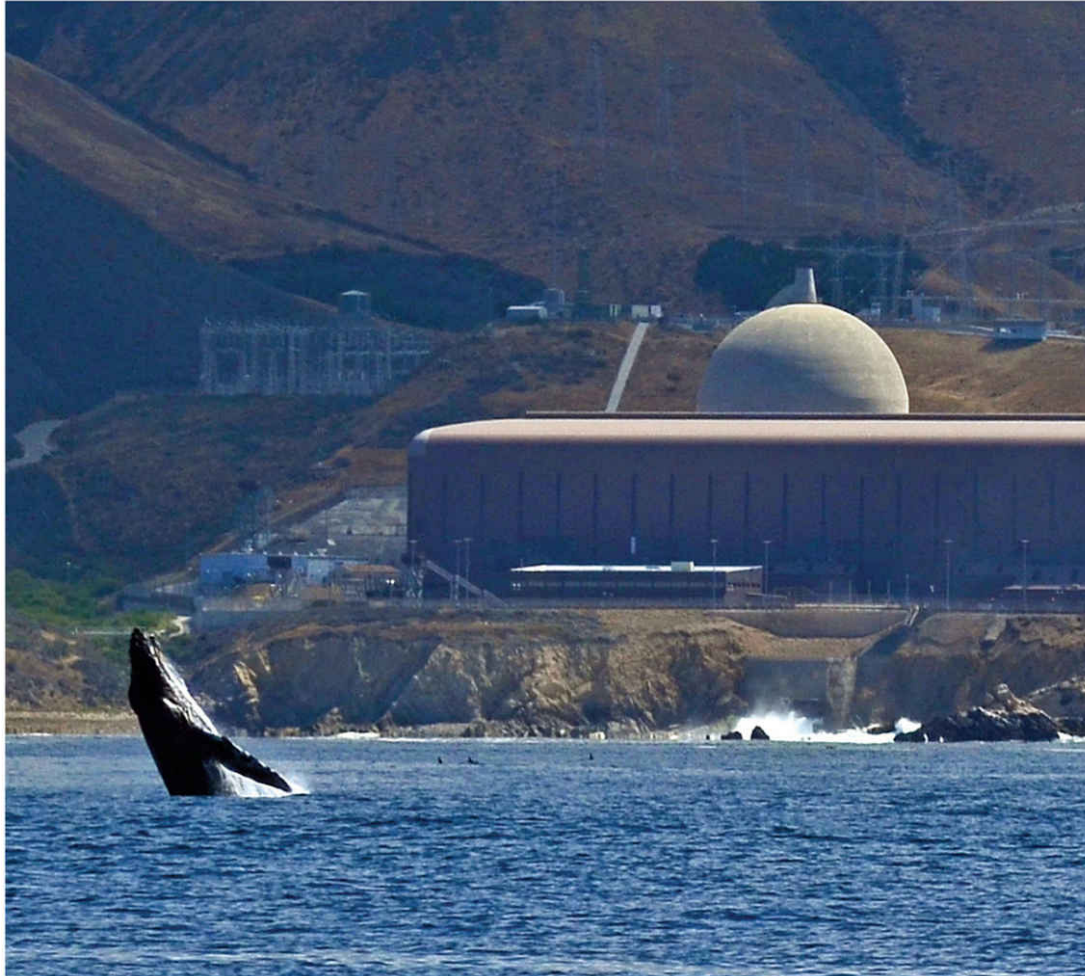
Whale populations have recovered since they were saved by kerosene in the nineteenth century and palm oil in the twentieth century. This whale swims in front of the Diablo Canyon nuclear power plant. (John Lindsey)