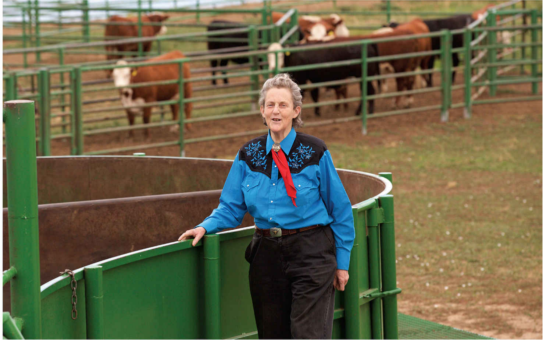
Temple Grandin says her autism made her more empathetic to stresses of farm animals. McDonald's Corporation and others have adopted her methods for raising cattle more humanely.