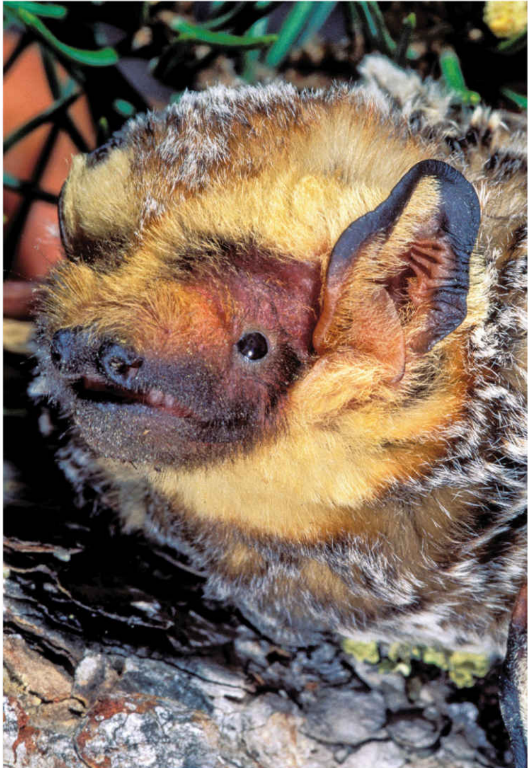
Wildlife biologists in 2017 warned that the continued expansion of industrial wind turbines threatens the extinction of the hoary bat, which are killed directly and indirectly from pressure on their lungs.