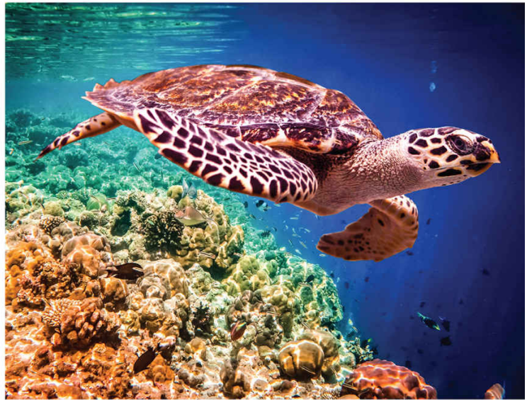
Plastics made from fossil fuels replaced natural plastics, including hawksbill tortoiseshell used in eyeglasses.