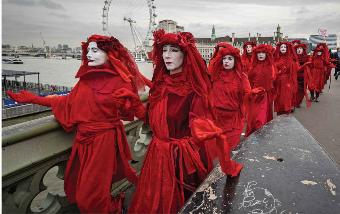
Extinction Rebellion activists, claiming climate change threatened human extinction, halted traffic in London in the spring and fall of 2019.