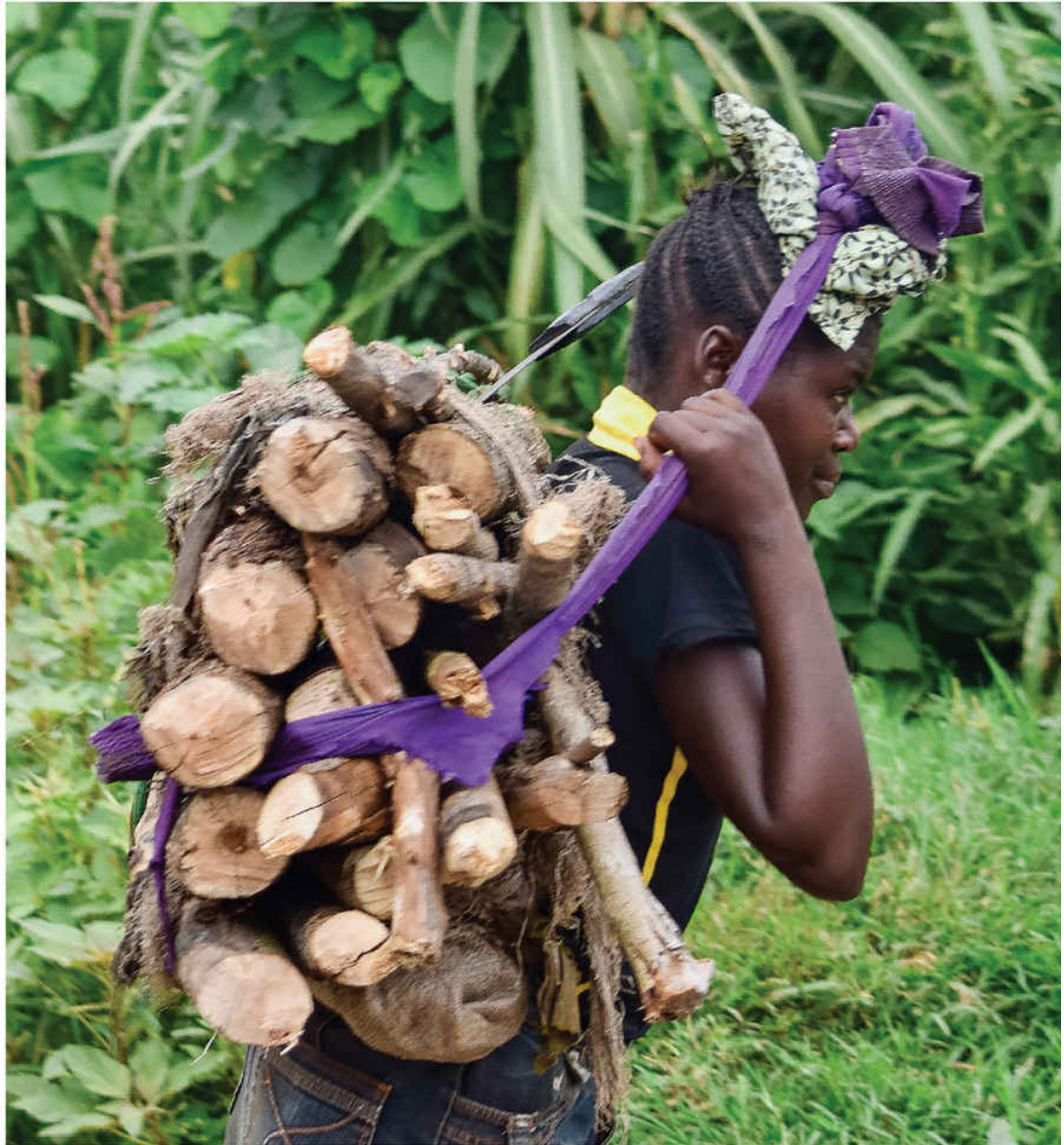
In poor nations like Congo, women and girls complain more of the time they have to spend chopping, hauling, and burning wood than they do of the smoke it emits. (Michael Shellenberger)