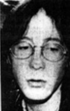
Julian Lennon, John Lennon's son, arrives at the Dakota where his father was killed.

Some people thought the Beatles would revolt, but Lennon knew better. As he put it in a recent interview: "Whatever made the Beatles the Beatles also made the '60s the '60s and anybody who thinks that John and Paul got