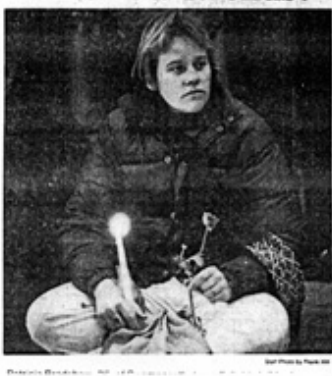
Portrait of Chapman, 25, in 1980.