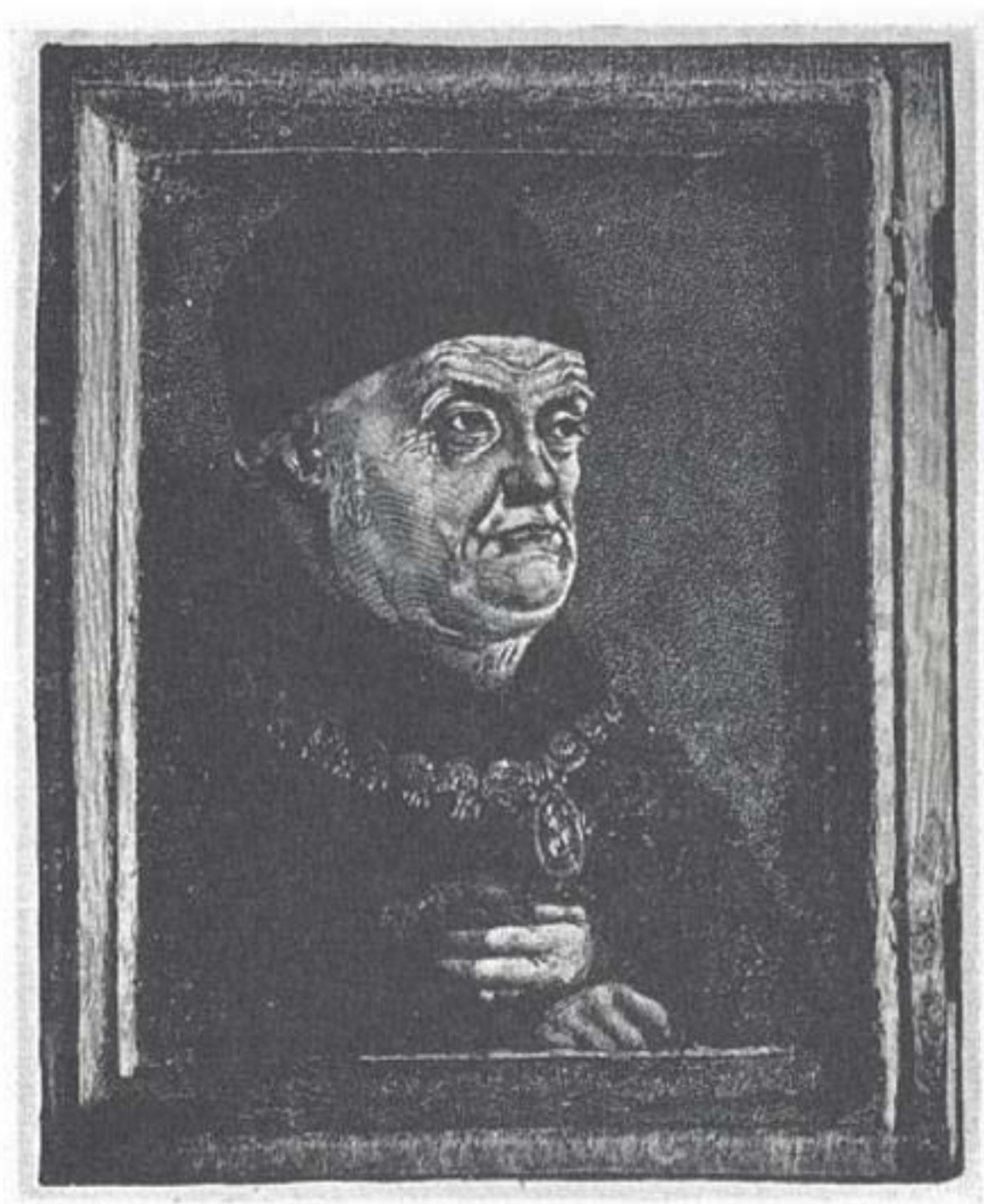
King René, the minstrel-monarch of Provence.

T IME WORE ON. The fruit of the prophet's nocturnal visions multiplied enormously as the history of events to come unfolded its vast stretches before his eyes. Nostradamus, in common with most men of genius, began to feel the urge to share his vision with the world. Yet he knew he would have to move very cautiously in presenting his work to the public. Its peculiar nature made necessary all possible safeguards against suppression or destruction not only during his own lifetime but in the future centuries with which his prophecies were concerned. His plans must be carefully made, there must be no mistakes.