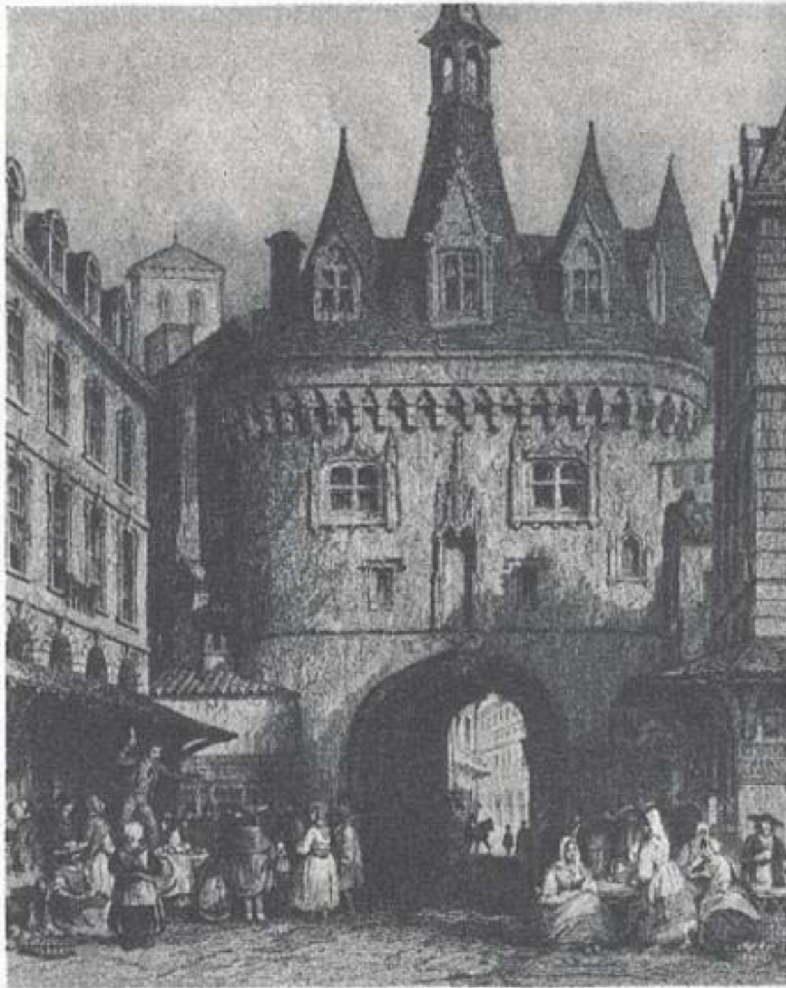
Through this old gate traveled Nostradamus on errands of mercy and friendship

N OSTRADAMUS HAS SAID, concerning his psychic gift, that it was inherited. Undoubtedly he had been conscious for a long time that he possessed it, and had used it to divert friends occasionally, as his grandfather had amused him when he was a child. During the period of his wanderings, under the emotional tension of sorrow and loneliness, such a faculty would tend to develop even without encouragement. Occult friends and associations, if such there were, would have given impetus to experiment with this perception, and fresh insight perhaps into the laws under which it manifests.