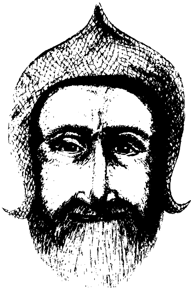
Drawing of Nostradamus, as seen by Elena in trance.