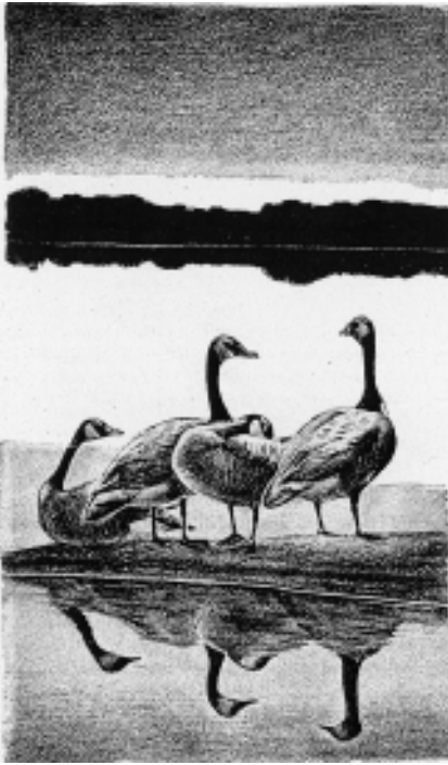
Figure 7 Sand County Almanac (Oxford University Press)

Gernot Böhme's work offers a very different argument. 10 Böhme makes a case for a new aesthetics of the natural world. He argues that natural beauty is not our projection of art-derived modes of seeing, but that aesthetic qualities are out there, objective presences registered by the human body as itself part of nature. It makes as much sense to call a particular valley 'serene' as it does to call it 'green' or 'steep'. For proof, consider that someone in a completely different state of mind, say grief-stricken, can still recognise the valley as having 'serene' qualities, even if these are currently blocked out. The serenity is an objective quality of the place for human perceivers. Böhme also refers to the art of landscape gardening, which gives objective methods of producing moods or atmospheres in nature that are recognised by anyone.