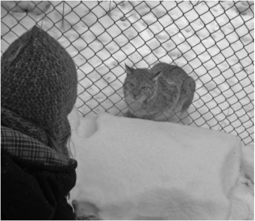
Figure 14 Cage wire, woman and lynx (the author)

animal could supposedly share, whether that be reason, a soul, language, imagination or humour.