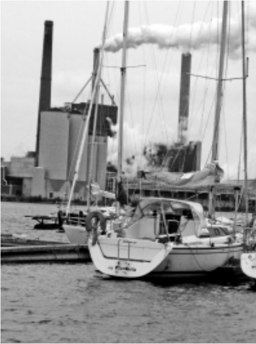
Figure 10 Disorientation: luxury and pollution (the author)

not a new environmental cosmopolitanism more suitable to a world in which environmental effects so immediately disregard borders?