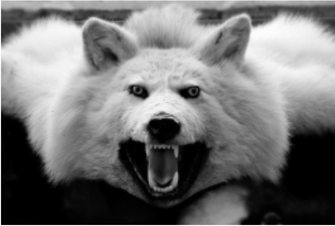
Figure 4 Wolfskin rug (Nicmac)

and by anecdotes of wolf behaviour, some factual and some more speculative. A section on the constellation ‘Lupus’ (the Latin for wolf) is even a kind of prose poem. In a Japanese context, Ishumure Michiko’s Paradise in the Sea of Sorrow (1972) is similarly transgressive of genre, engaging the horrific effects of mercury pollution through a mix of non-fiction, mythology, journalism, autobiography and storytelling. 9