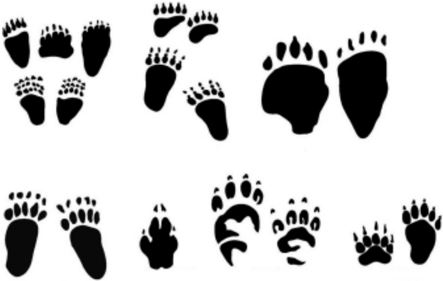
Figure 15 Animal trails (Pavel Konovalov)

serious consequence of the cruelty and bad treatment inflicted on [animals] is that man degrades himself and loses his humanity ". 20 In other words the non-human has moral worth only as a kind of sounding board and mirror for human self-conceptions. In sum, Ferry's arguments against environmentalism rest on a dogmatic and unexamined understanding of the human–animal opposition, one allowing subjectivity and ethical consideration to the human alone.