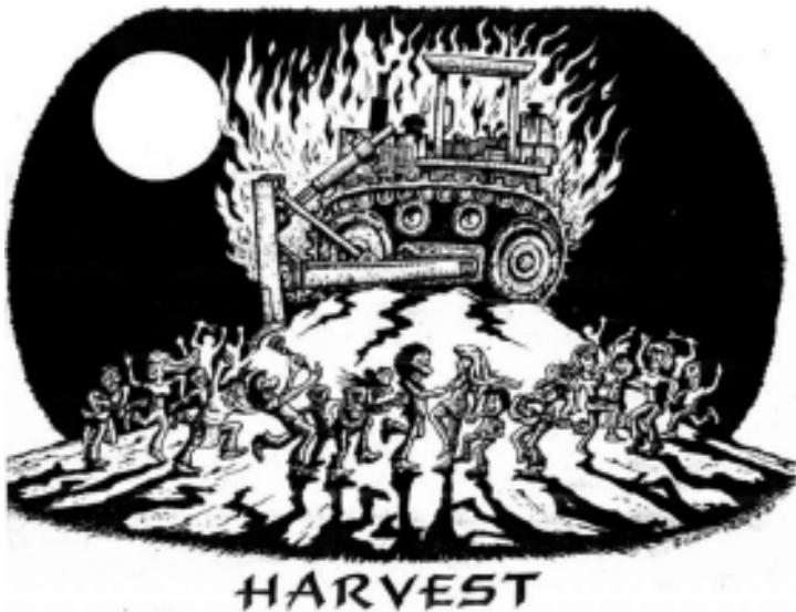
Figure 8 Eco-sabotage (Earth First!)

about. 16 Few people are as direct as the vehement essayist Chen Yu-feng, who, living on the increasingly trashed island of Taiwan, develops ecological ideas into an open advocacy of eco-sabotage. 17