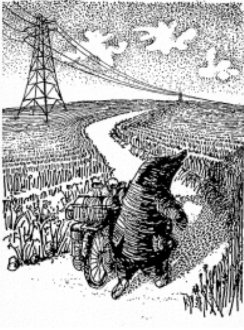
Figure 17 The Wind in the Pylons (Brill Books)

appropriating of animal otherness or a term that rebounds into the open question of what the human actually is. Finally, in the tension between these views, anthropomorphism in literary texts may enact an ethical and cognitive challenge to re-evaluate the bases of modern society. The non-human effects both a defamiliarisation of human perception, an undermining of ‘speciesism’ and a potentially revolutionary ethical appeal against the brutal human tyranny over the animal kingdom.