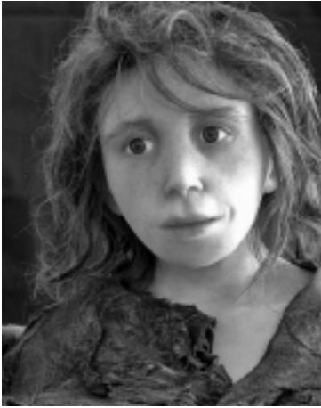
Figure 12 Neanderthal child (Christoph P. E. Zollikofer)

Marshall's understanding of prehistory as the site of an original human nature seems also questioned by both the large number and the sheer variety of prehuman hominid species. This alone destabilises any claims of some 'original' human nature. It also unsettles the lines of difference between human animals and others. 13 If any image might undermine at a stroke all assertions of human exceptionalism, it might be that of the face of a Neanderthal child, reconstructed from fossil remains. 'Its' gaze encounters ours with the unspeakable poignancy of an extinct species.