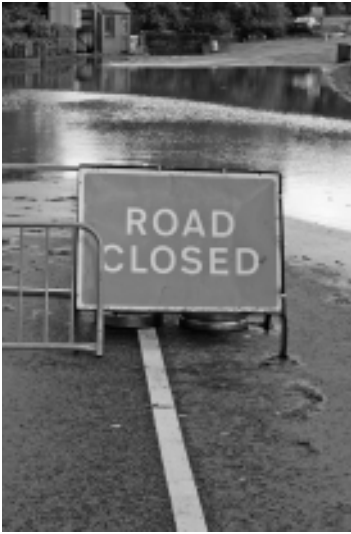
Figure 1 Flooded road (Stuart Key)

and that this will end only with their own demise – either in the form of their political overthrow or, more likely, through environmental catastrophe.