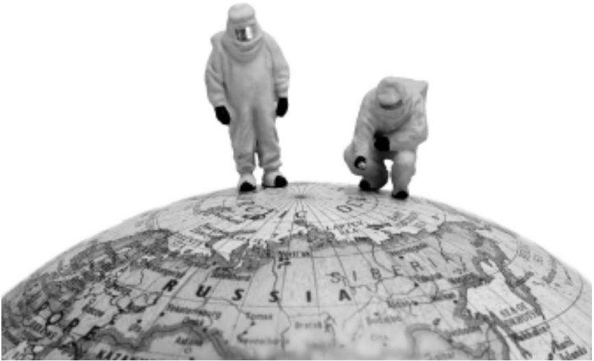
Figure 11 Global warming science

design of fishing nets. Such pressure takes people well beyond any pretence that scientific work is merely factual or apolitical. The list of issues that patently transgress supposed borders of fact and value grows longer each year. Latour lists some of them: