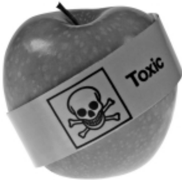
Figure 5 GM protest (Spinka2)