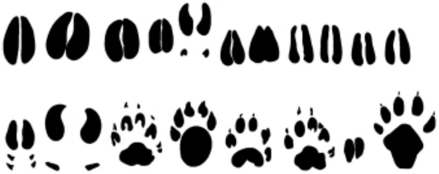
Figure 18 Animal trails (Pavel Konovalov)

[Badger] ‘With just a bit of persuasion you could become a mole for us. I mean – you understand – at Toad Transoceanic’ . . . [Mole] ‘But I am . . . I am a mole.’ [Badger] ‘Yes but I mean, a mole . An underground animal .’ ‘Ah. O.’ The mole hesitated, thinking very hard. ‘Surely, surely, the Badger could not be mad too.’ 18