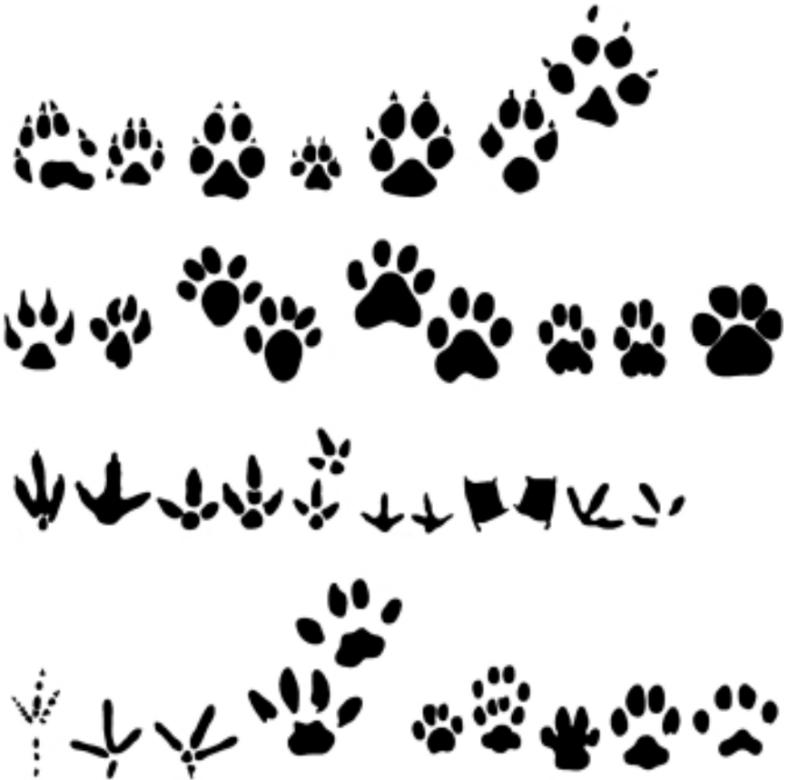
Figure 13 Animal trails (Pavel Kononov)