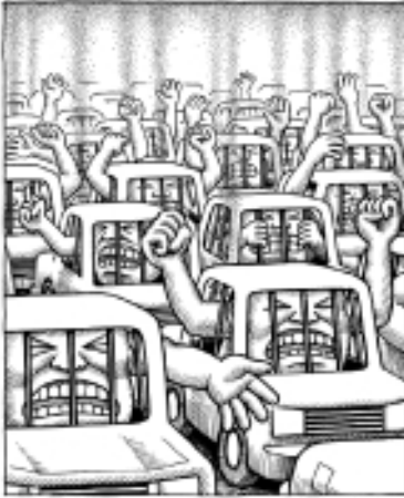
Figure 9 Road rage (Earth First!)

bourgeois (masculinist) ideal as its measure? 12 Worse, it reinforces the liberal norm by way of protestation of exclusion from it. As we saw, one of the failings of some work in the field of environmental justice is that it sometimes still turns on the issue of inclusion–exclusion in relation to this norm, focussed more on moral outrage than with engaging ‘post-materialist’ values or the defence of alternative modes of life. There have been no convincing rebuttals of the maxim that for everyone to have the material standard of living of the average American would require the additional resources of three more planets the size of the earth. 13 Does this not also mean that readings of modern literature and social exclusion that implicitly endorse a just world as one in which everyone could, for example, own a car, are not cogent, for such a world would have already consumed its own future?