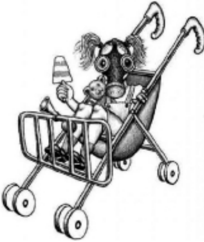
Figure 6 Child with gas mask (Earth First!)

society's general fears about its collective future and as an expression of an ontological rupture in its perception of the real. 14 In Christa Wolf's novel Accident: A Day's News (1997) the daily routine of a middle-aged writer during a beautiful spring day in a village in (then) East Germany is pervaded by news of the nuclear accident at Chernobyl. Anxieties about predicted fall-out drastically alter perception of the radiance of the sun; there is a sense of the collapse of normally defining geographies, the distinction between the familiar and consoling and the far away and dangerous. Can the nature poetry of the past ever be read in the same way? Who will again write so innocently of a 'cloud' or 'white cloud' (wandering lonely or otherwise)? The garden must be weeded wearing rubber gloves. 15