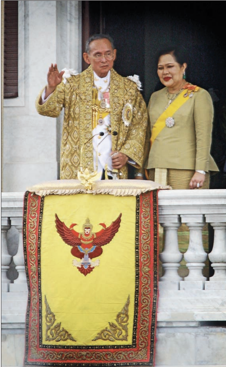
King Bhumibol Adulyadej ascended to the throne of Thailand on June 9, 1946, and is the longest-serving monarch in the world. Adulyadej is pictured here, in 2006, with his wife, Queen Sirikit, at the royal palace during the sixtieth anniversary of his coronation.