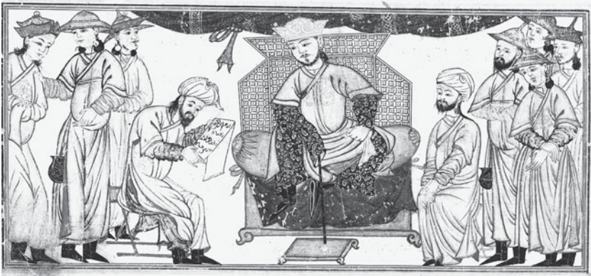
كان السلطان ملك شاه بن الب ارسلان سلطانا جبارا قد ساعد في الوقت وواقفته الأيام وكان حشده اسياب سلطنته هائلة وكان من اول اقطابه الباقوت وقتما اتوفى الامان كان حشده ابيه العادل وحشده حظه هم غرسوا شجرة الدولة وهو كل ثم ثمرها وكان ثلاثة عضدا الدولة ورج سيات الملك

وهو السلطان جلال الدولة والدين ملك لشاه ابو الفتح بن الب ارسلان محمد بن طوكدن