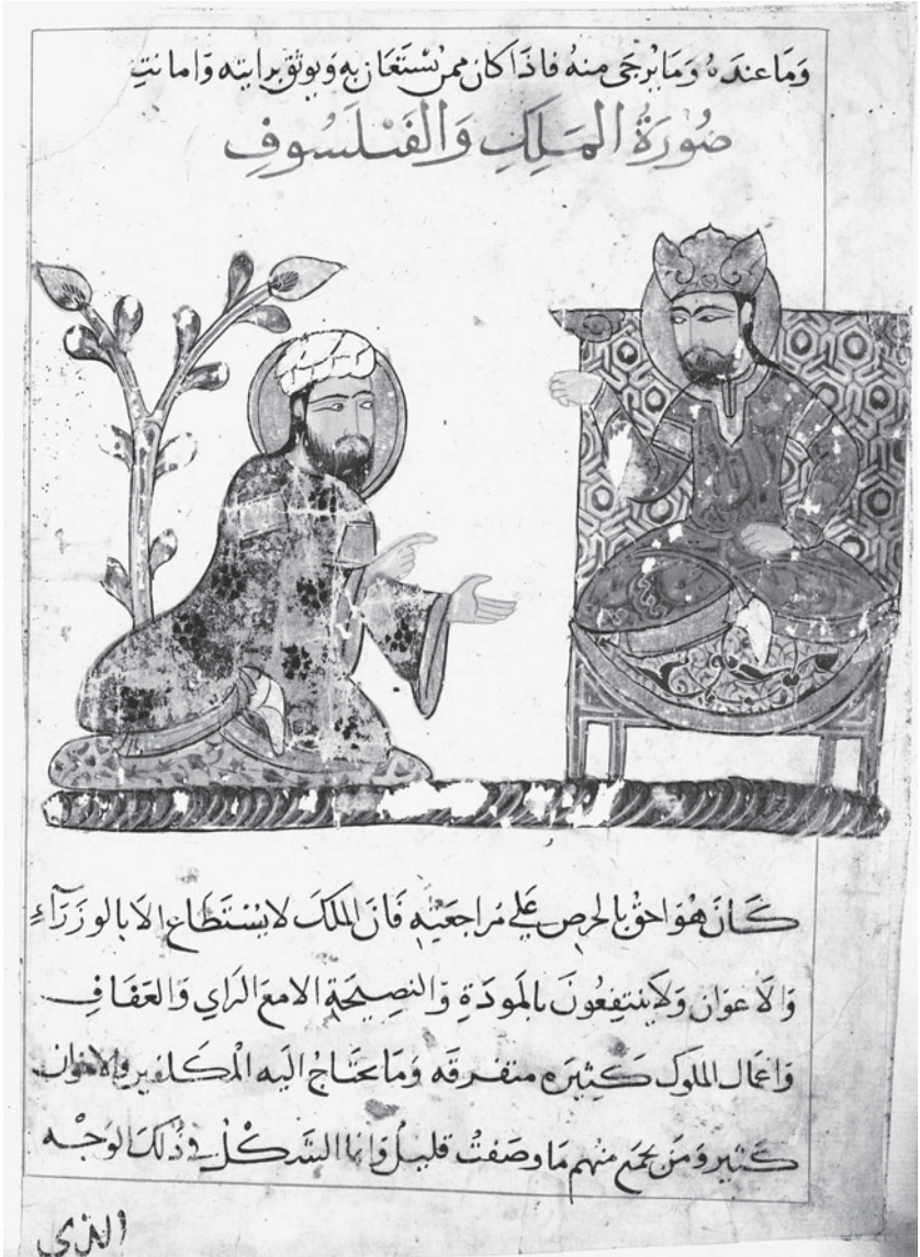
FIGURE 2.3 The king and the philosopher, the king wearing a Seljuq crown and sitting on a Seljuq throne (cf. figs. 1.1, 1.2, and 1.5). Miniature from a manuscript of Kalila and Dimna , dated 755/1354 (Bodleian Library, University of Oxford, MS Pococke 400, fol. 136b).