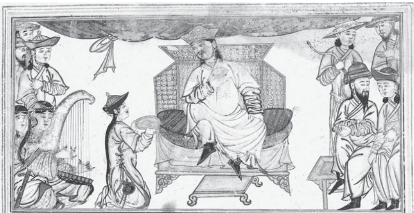
FIGURE 1.5 Sanjar as Sultan among his court. Miniature from Rashīd al-Dīn Ṭabīb's Compendium of Chronicles (Edinburgh University Library, MS Arab 20, fol. 142a).

In the late months of 499 / summer of 1106, shortly before the turn to a new century in the Islamic calendar, al-Ghazālī began teaching at the Niẓāmiyya madrasa in Nishapur. 228 That event prompted the writing of his autobiography, The Deliverer from Error , which responds to criticism from both close followers as well as hostile scholars. There, he legitimizes his return to the Niẓāmiyya schools by linking it to the needs of an epoch characterized by religious slackness ( fatra ) and the temptations of false beliefs. Al-Ghazālī says that he consulted with a group of people “who have a pure heart and religious insight ( mushāhada )” who advised him to leave his seclusion and emerge from his zāwiya to lead the much-needed religious renewal at the beginning of the new century. In addition, al-Ghazālī mentions that “the sultan at that time” ordered him to come to Nishapur. From al-Ghazālī's letters, it becomes clear that Fakhr al-Mulk, a son of Niẓām al-Mulk and vizier to Sanjar (see figure 1.5), put pressure on al-Ghazālī. He wanted al-Ghazālī to return to state-sponsored