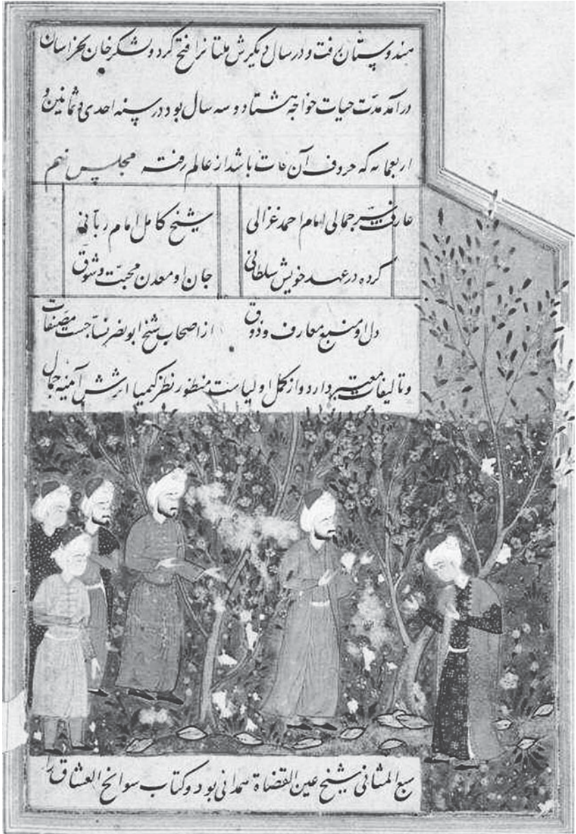
FIGURE 2.1 'Ayn al-Qudāt al-Ḥamadhānī meets Aḥmad al-Ghazālī in a garden. Miniature from a manuscript of Kamāl al-Dīn Gāzurgāhī's (d. after 909/1503–4) Assemblies of God-Lovers ( Majālīs al-ushshāq ), produced c. 967/1560 in India. (MS London, British Library, Or. n837, fol. 57b).