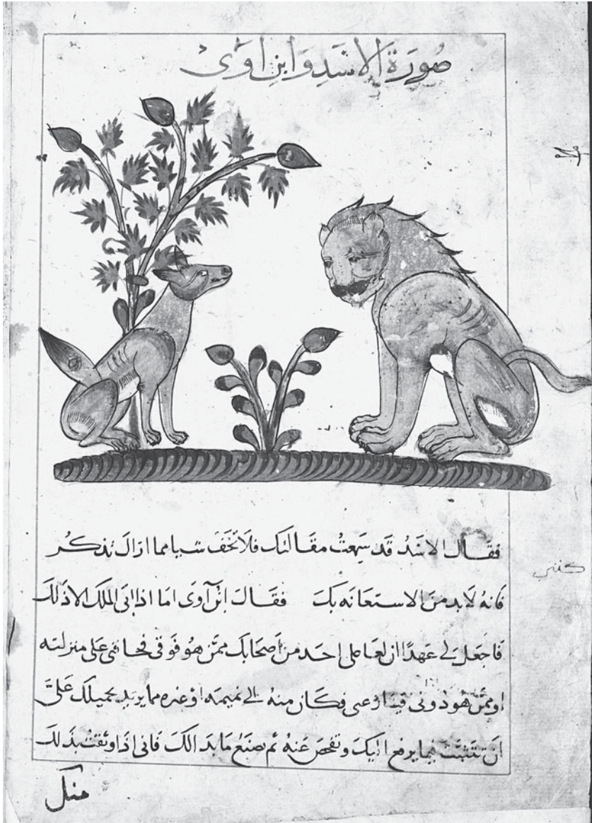
FIGURE 2.2 The lion and the jackal. Miniature from a manuscript of Kalila and Dimna , dated 755/1354 (Bodleian Library, University of Oxford, MS Pococke 400, fol. 138b).

wise counsel. In order to avoid the well-known hazards, he aims to become a loyal member of the court, to please the king and win his confidence, and only then will he give honest council. This strategy is successful, until the other courtiers become jealous of the jackal's success and start to plot against him. They employ underhand tactics to cast suspicion on the jackal's sincerity. The king throws the jackal in jail and has him surveyed by his agents, who tell him