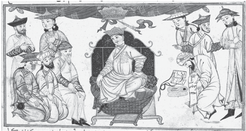
FIGURE 1.2 Sultan Berk-Yaruq among his court. Miniature from Rashīd al-Dīn Ṭabīb's Compendium of Chronicles . The miniatures in this manuscript (same as figures 1.1 and 1.5) are the earliest extant historical illustrations in Islam (Edinburgh University Library, MS Arab 20, fol. 139b).