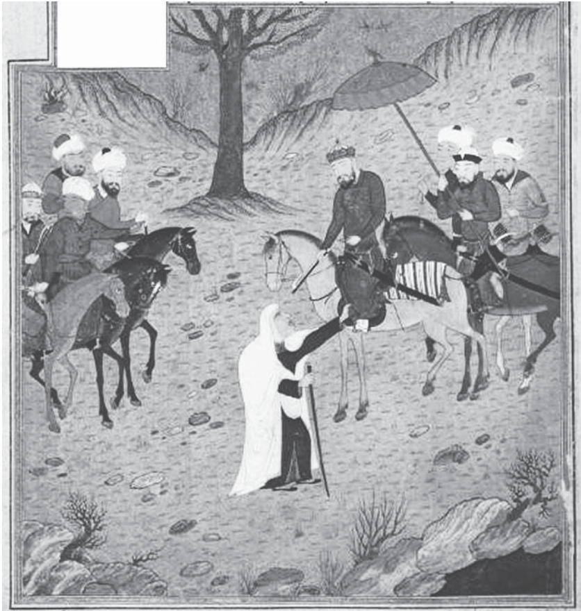
FIGURE 2.4 Sultan Sanjar admonished by an old woman. Miniature illustrating a story from Nizāmī's Quintet ( Khamsah ), attributed to the famous painter Bihzād (d. 942/1535–36) or his workshop in Herat (Afghanistan) and dated 901/1495–96. (MS London, British Library, Or. 6810, fol. 16a).

tween those who use the sword as their weapon and those who use the pen. The Turk nomads' military hegemony—today we would say their military dictatorship—triggered much reflection about the mores and the conduct of this new type of rulers who, unlike earlier sovereigns, were most often not participants in the literary, moral, or theological discourses of their time. Such reflections appear frequently in the Islamic literature of the sixth/twelfth century. The Persian poet Nizāmī, for instance, who wrote at the end of that century, includes in the first of the five epics of his highly popular Quintet ( Khamsah ) a story of how an old woman admonished the powerful sultan Sanjar. The poor woman who had been wronged by one of Sanjar's troops approaches his entourage and grabs the sultan's garment (figure 2.4).