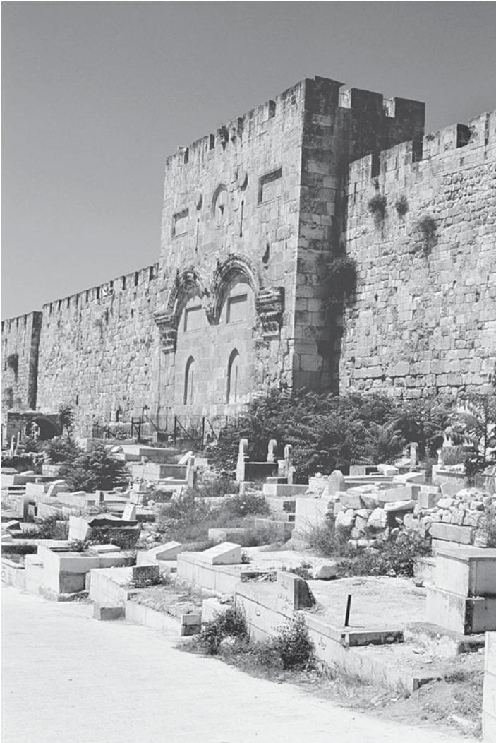
FIGURE 1.4 The Gate of Mercy in Jerusalem. View from outside the city wall.

Al-Ghazālī left Jerusalem in the fall of 489/1096 in order to take part in the annual pilgrimage at the end of that year. On his way to the Hijaz, he stopped in Hebron and visited the graves of the patriarchs, making the aforementioned vow. 195 From Hebron, al-Ghazālī continued to Mecca and Medina. His participation in the pilgrimage of 489 is a well-documented event. 196 Some Muslim