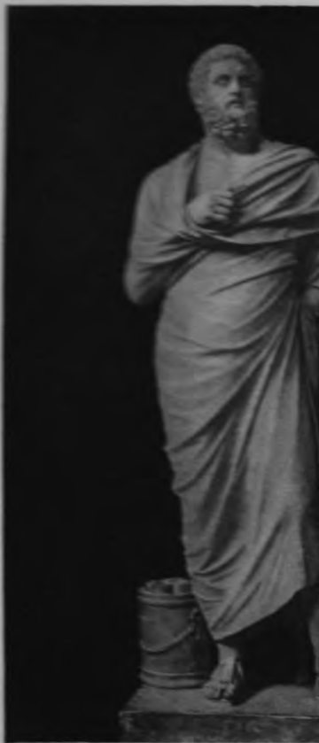
SOPHOCLES STATUE IN THE LATERAN MUSEUM