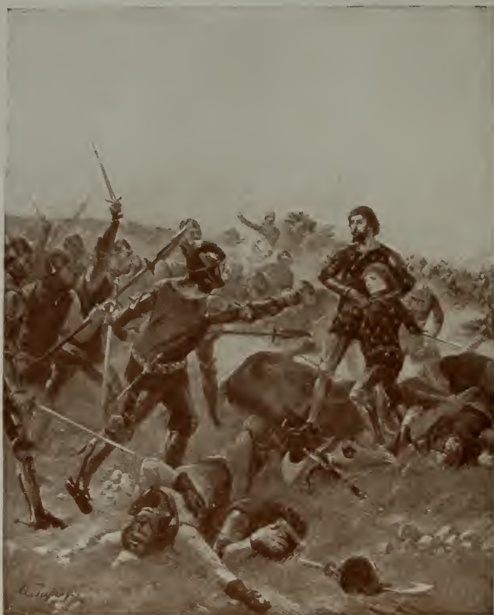
The Battle of Poitiers From the painting by H. Dupray (See page 52)