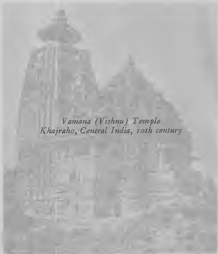
Vamana (Vishnu) Temple Khajuraho, Central India, 10th century