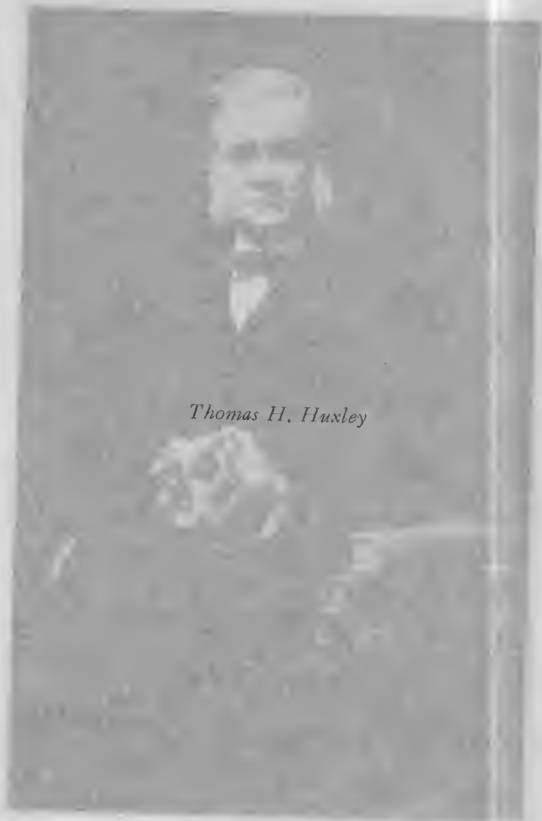
Thomas H. Huxley